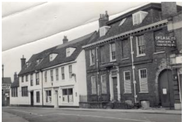
Bull Plain c.1972, showing the museum and its derelict neighbour, Beadle House.

Between now and then however, we will be busy behind the scenes arranging various events and activities (see pages 2 & 3 for details of outreach events). We are also selecting objects for new displays and writing gallery text panels.